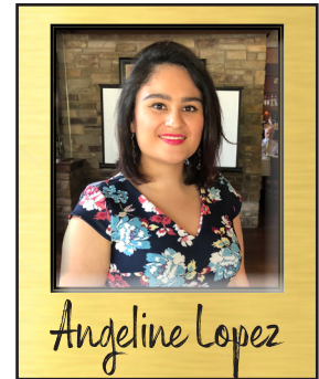
Morris Catholic High School Consultant, Internal Audit Verizon

Senior Recognition • Presentation to Parents • Alumni Hall of Fame Awards