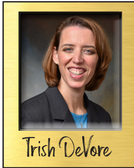
Bayley Ellard High School Director, HR Business Partner Prudential Financial